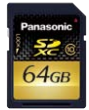
SDXC Memory Card (64GB)

The AVCHD recording format used by the AG-AF100 series includes a professional PH mode with maximum AVCHD bit rate for stunning image quality. Two SD card slots allow continuous recording for up to 12 hours* in PH mode and up to 48 hours* in HE mode with two SD (SD/SDHC/SDXC) cards on board.