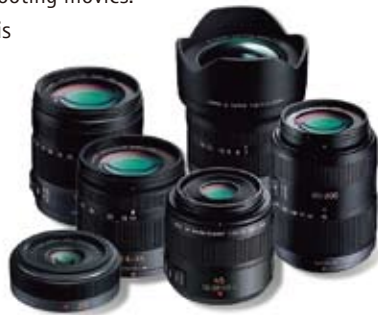
Micro Four Thirds Camera Lenses

With the mount adaptor, it is also possible to mount 35mm film camera lenses and prime lenses, to render images that maximize lens characteristics.